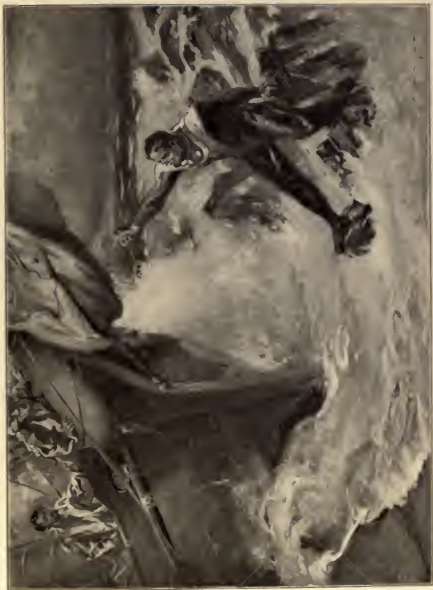
The slightest misstep on the slimy rocks meant sending him under the sloop's bow.